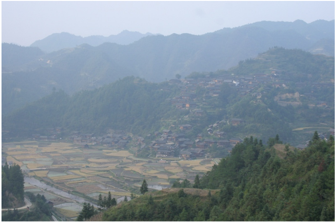
Leigong Shan (CN288), one of the many forests in the mountains of Guizhou which support the characteristic bird species of south-western China.

IBAs are represented on the map as circles proportional to their areas.